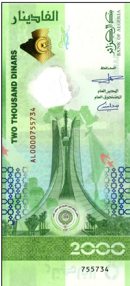
Figure 1 – B413 2000 Dinar front, 2022

I have chosen the B413 note because it depicts THREE UNESCO sites! These include Kasbah of Algiers, The Tassili n'Ajjer mountain range and the only site depicting the UNESCO site Tipasa. On the shores of the Mediterranean, Tipasa was an ancient Punic trading-post conquered by Rome and turned into a strategic base for the conquest of the kingdoms of Mauritania. It comprises a unique group of Phoenician, Roman, palaeochristian and Byzantine ruins alongside indigenous monuments such as the Kbor er Roumia, the great royal mausoleum of Mauretania. All of these sites are on the back of the note. The note has two other features worth mentioning. It is an IBNS Bank Note of the Year nominee for 2022 – loaded with security features! It has a somewhat unique substrate called DuraNote by the manufacturer LandQart. It is a “sandwich”, with layers of paper/polymer/paper as can be seen in the window. I used a black background to display the crescent and star on the back image.